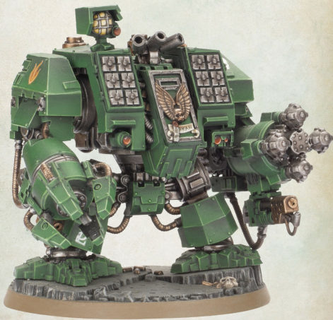
This Ironclad Dreadnought is armed with a power fist and seismic hammer.