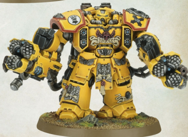
Assault Centurions with siege drills