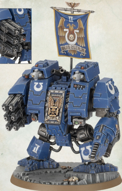
Ironclad Dreadnought with hurricane bolter and chainfist