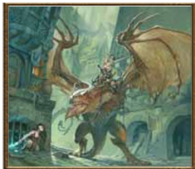
Illustration by Jesper Ejsing

The Fraternal Order of the Vault is an organization of rogues who emphasize the making and breaking of locks and traps along with other mechanical skills.