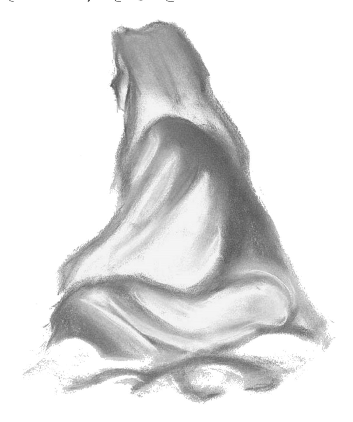
A Non-Mythos Book Of Ideas For Call of Cthulhu Or Any Horror RPG